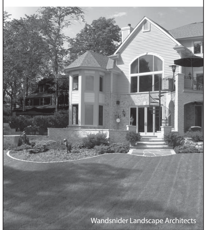
Wandsnider Landscape Architects

Space is limited, and reservations are required. Call the Milwaukee/NARI Home Improvement Council office at 414-771-4071 to reserve your space or send an e-mail to info@milwaukeeenari.org .