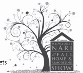
Bring Inspiration Home

For more Fall Home & Remodeling Show information, including advance ticket locations, visit www.milwaukeevari.org or call the Milwaukee/NARI office at (414) 771-4071.